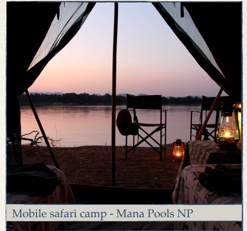
Mobile safari camp - Mana Pools NP

The area is very different to the arid conditions of Chitake. Towering mahogany and fig trees dwarf elephants and acacia thickets provide the perfect environment for denning African wild dogs. Again, we have the freedom of setting our own safari activity agenda - exploring by open 4x4 vehicle and by foot.