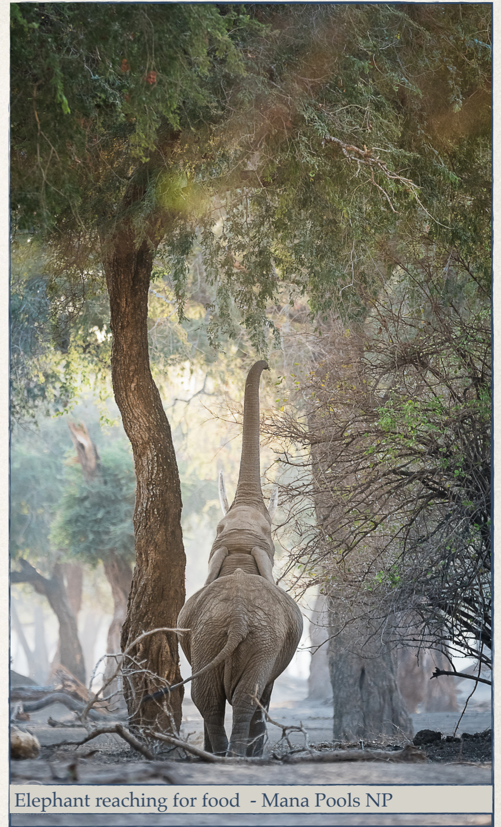
Elephant reaching for food - Mana Pools NP