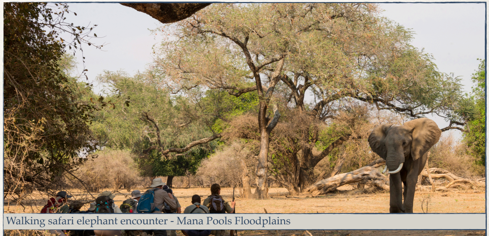
Walking safari elephant encounter - Mana Pools Floodplains