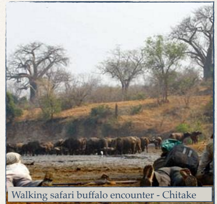
Walking safari buffalo encounter - Chitake