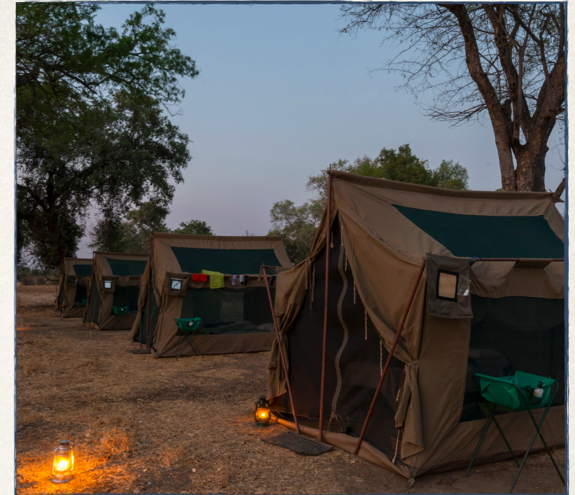
Chitake Campsite - Mana Pools NP