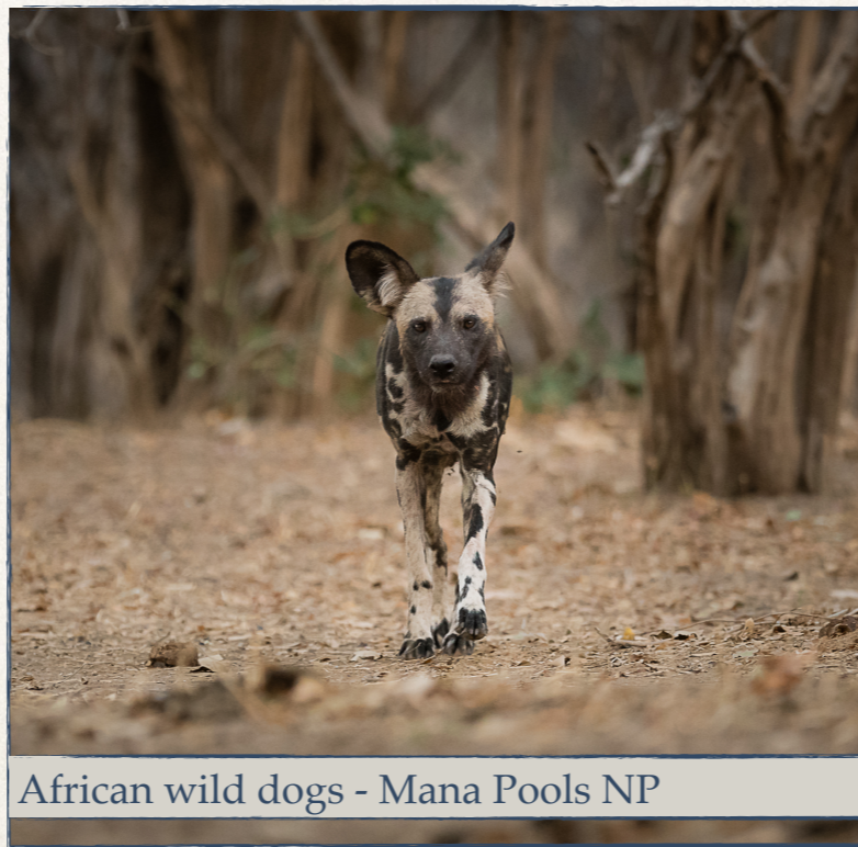
African wild dogs - Mana Pools NP

*Should Covid testing still be required before departing Zimbabwe, this will be carried out in Harare upon our arrival with test results returning within a couple of hours. We will have access to a comfortable lounge during this time.*