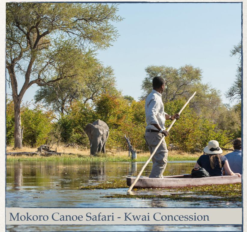
Mokoro Canoe Safari - Kwai Concession

We'll arrive at our camp which has been seemingly miraculously transported from Makgadigadi to Savuti and set up in an area which has been specially selected to give us optimum wildlife viewing accompanied by remote seclusion for the ultimate immersive safari experience.