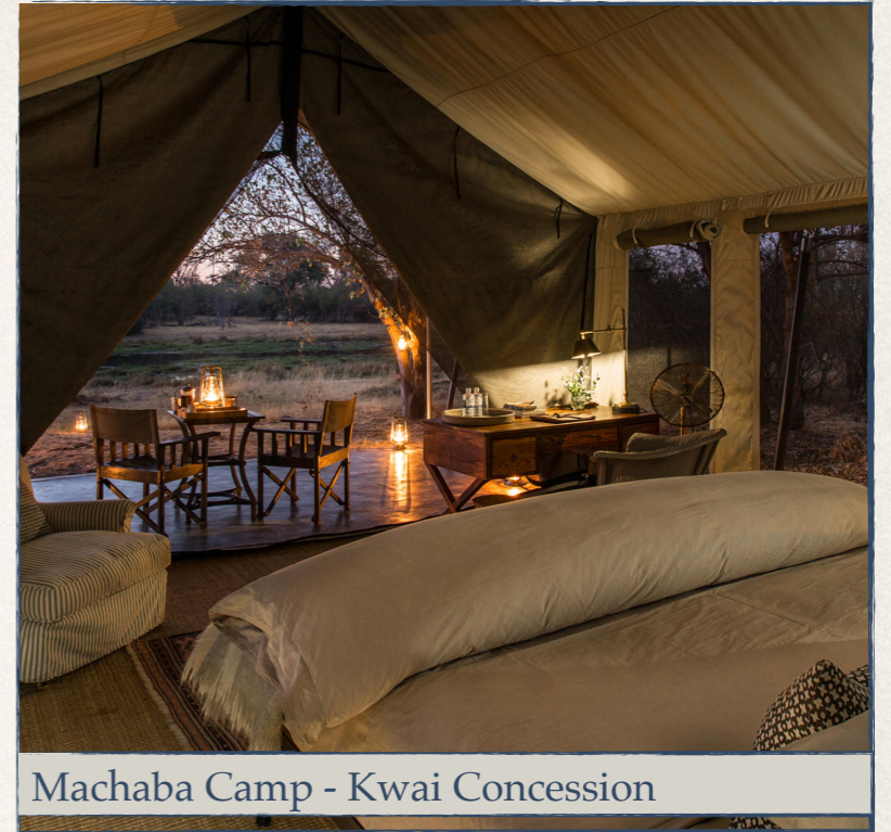
Machaba Camp - Kwai Concession

Depending on arrival time and water levels we should be able to head out in a Mokoro - a traditional canoe, to explore the waterways and gaining different perspectives for photography. It's here where leopard sightings are considered the 'norm'.