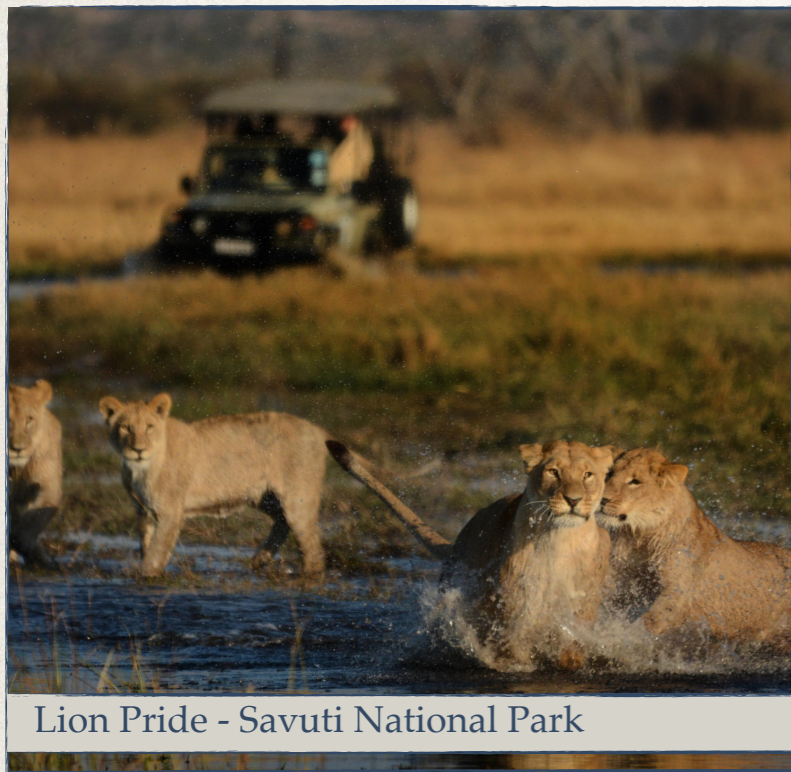
Lion Pride - Savuti National Park

Our local guide knows the area intimately and will share his favourite places to give us the very best opportunity to see the pure splendour of the Savuti region.