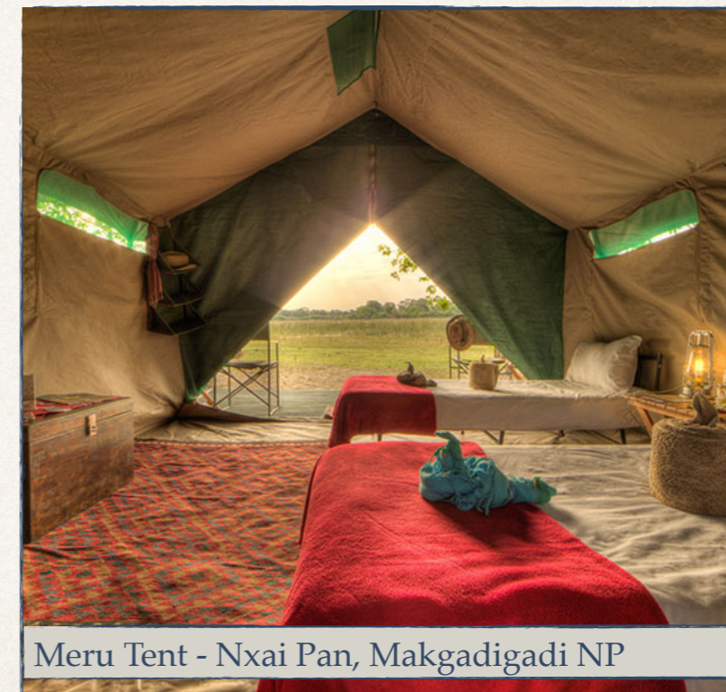
Meru Tent - Nxai Pan, Makgadigadi NP