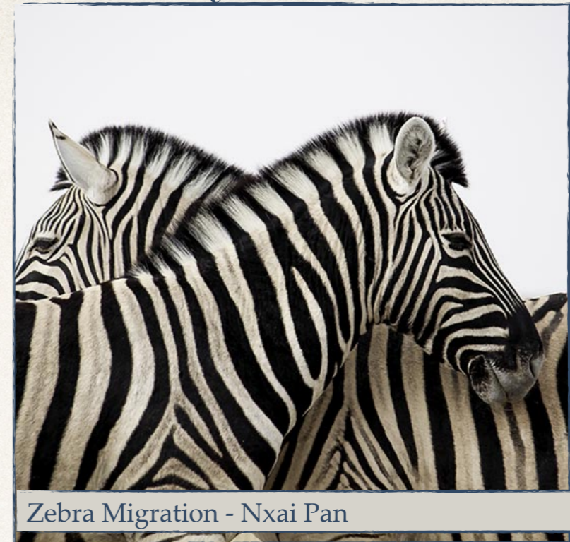
Zebra Migration - Nxai Pan

One day three - we will head out for a full day's exploration of the Nxai Pan, the Makgadigadi and of course the bountiful zebra migration - remember to keep an eye out for Gemsbok, Springbok and Cheetah!