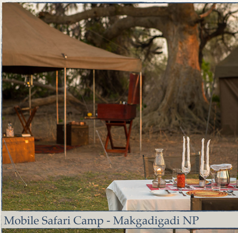
Mobile Safari Camp - Makgadigadi NP

A warm welcome into camp heralds the beginning of your safari! Alex and your local guide will give you a briefing of the adventure that lies ahead and go through photographic ideas with you, discussing settings and inspiration to begin creating your own wonderful portfolio.